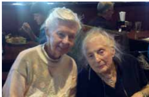
At The Elephant Bar