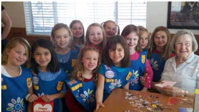
Girl Scout Daisy Troop Valentine's Day surprize!